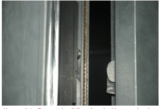
Heavy-duty fingerstrip sliding door locking mechanism

The fully automatic EMI/EMP/RFI-shielded sliding doors are designed for RF and EMP-tight enclosures. They can be integrated in EMI/RFI-shielded rooms and are also suitable for other types of shielding.