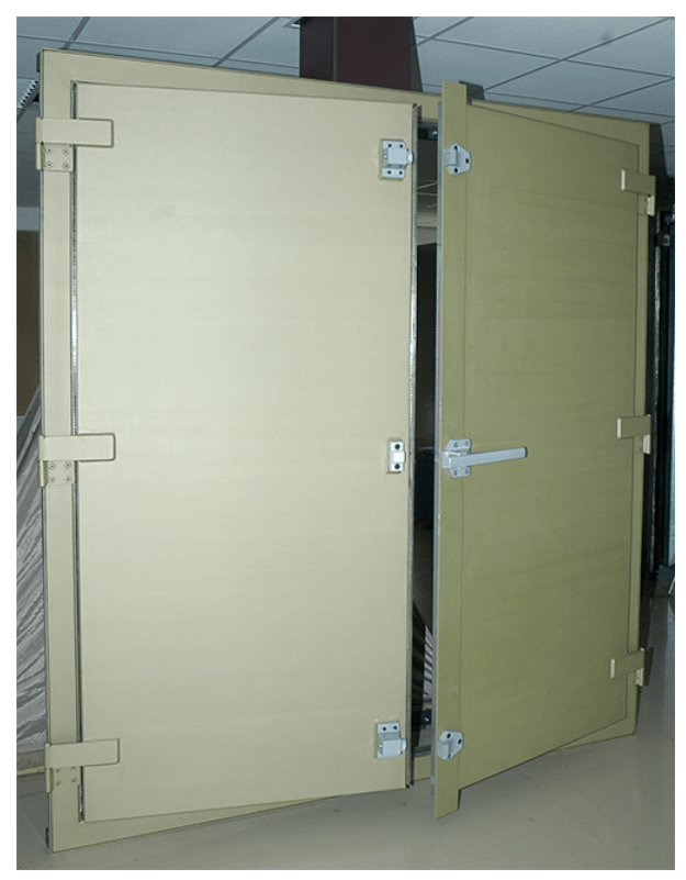
Ultra-high performance swinging doors