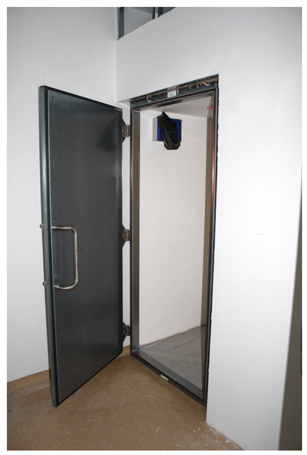
Swinging door (open)