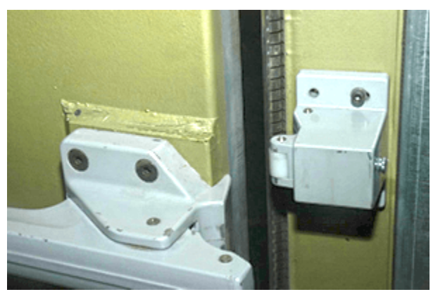
Swinging door locking mechanism

The fingerstrip swinging doors are well known for their high shielding performance and are used in prefab cages as well as in our Mu-Copper systems. We manufacture single fingerstrip doors for medium shielding performance and double fingerstrip doors for high shielding performance (reductions up to 140 dB). Delivery from stock is possible in various dimensions. In EMC applications, ferrite tiles can be affixed to the standard door leaf.