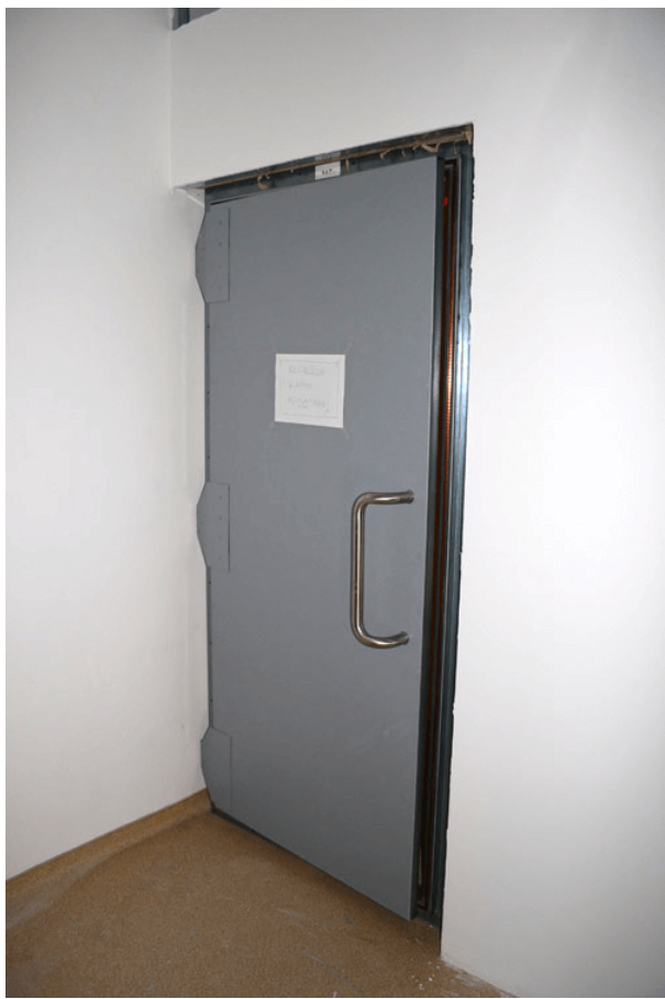
Swinging door (closed)