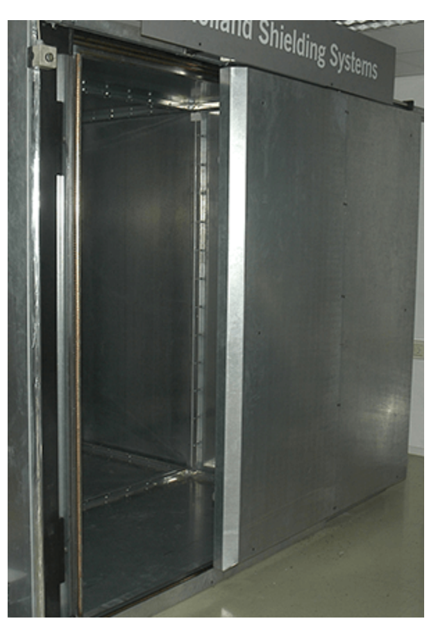
Heavy-duty fingerstrip sliding door for Faraday cages