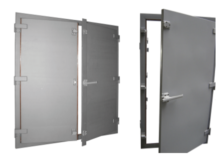
Double and single swinging fingerstrip Faraday cage doors

Virtually every type of door can be provided in a swingingor sliding implementation.