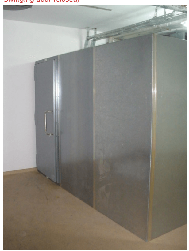
Swinging door in Faraday cage (closed)