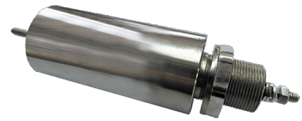
8005 series Feedthrough filters