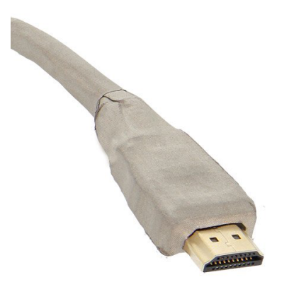
Please note. This is a example image of a 4975 series HDMI cable connector shield stuck on a HDMI cable. Please note, The cable in this example is fully shielded, so the cable itself is also packed with conductive textile. Click here for more information