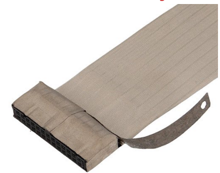
Step 3 . After the cable shielding material like the 4700S series Ready made sleave is mounted the cable will be fully shielded