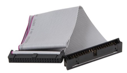
Flat cable without EMI shielding

Please note, also suitable for 7-pin serial ATA cable and 15-pin power connector for Serial ATA. Every other connector shield can be customized within a day.