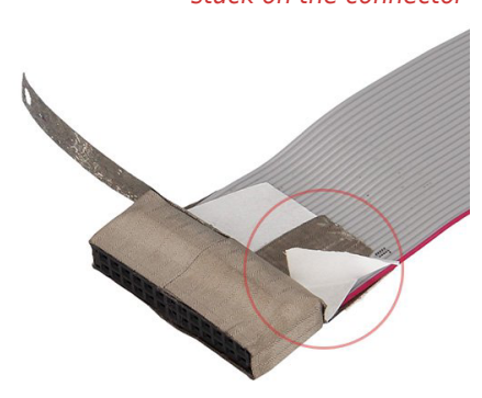
Step 2 . Release the lines so that you can make connection with the 4700S series Ready made sleave or any other cable shielding material