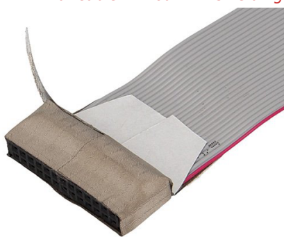
Step 1 . Flat cable connector shield stuck on the connector