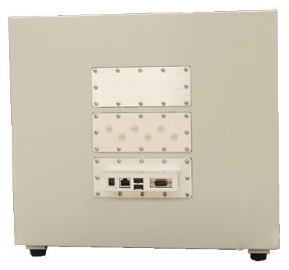
MPSB-35-40-30 Medium performance shielded box back view