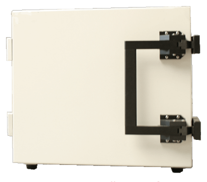
MPSB-35-40-30 Medium performance shielded box front view