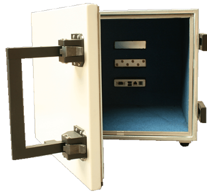
MPSB-35-40-30 Medium performance shielded box open view