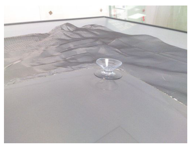
Easy toapply 1

Mounting the shield for signal-jammer cars is achieved easily, by means of suction cups to the windows. The shield we supply will be customized for your make and model car.