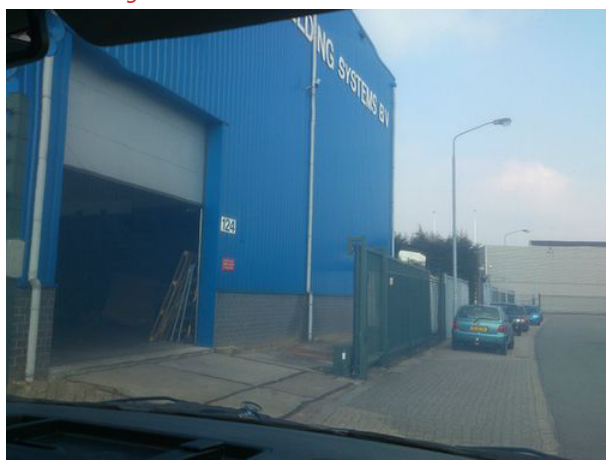
View through shielded windscreen4