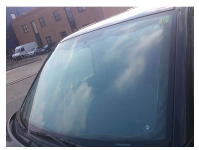
Outside windscreen 3