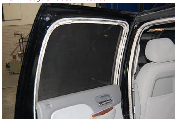
Inside of shielded side window

Please note : the top layer of the shielding foil can be affected by acids, for example from the skin. To protect the conductive layer, you can apply a transparent film or use the adhesive side on top.