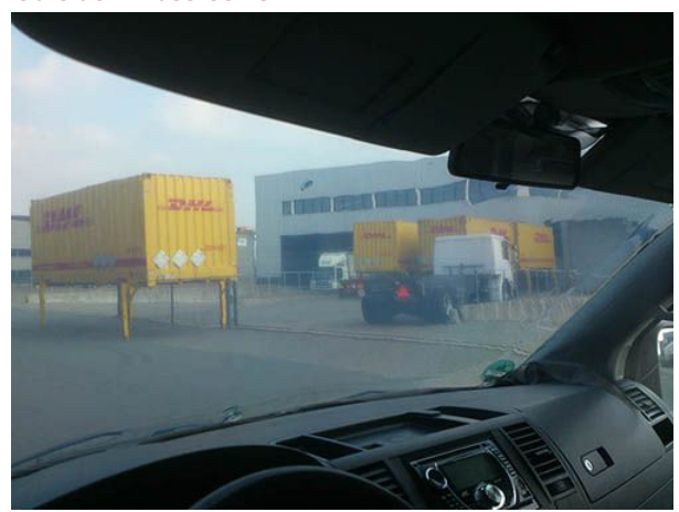
View through shielded windscreen 4