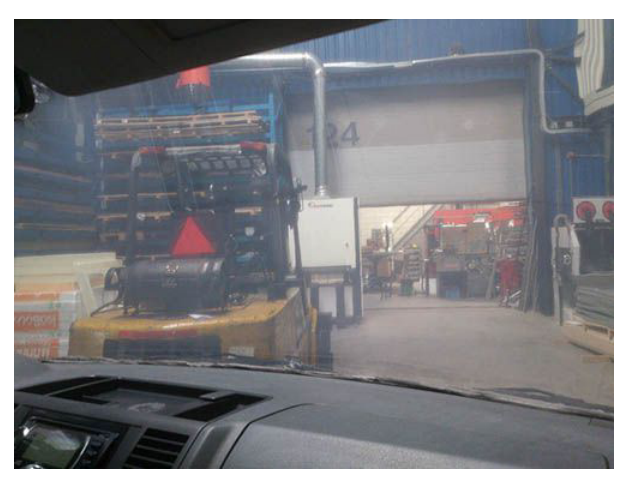
View through shielded windscreen1