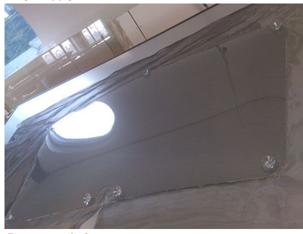
Easy to apply 2